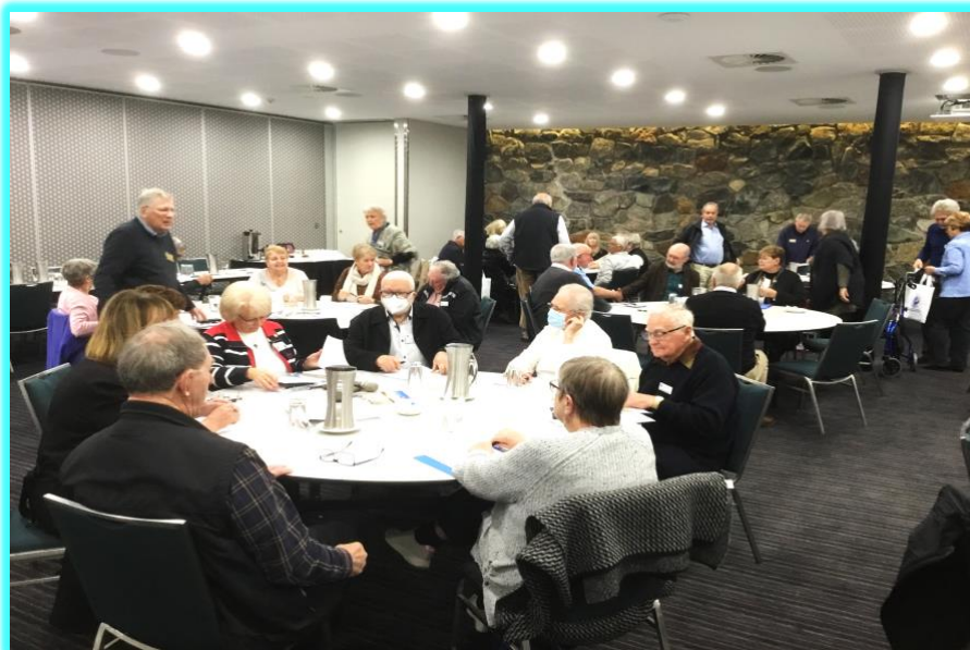
Club members assembling for the individual Breakout Groups