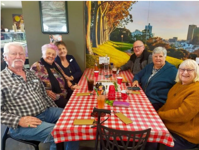
The Probus Club of Thornlie