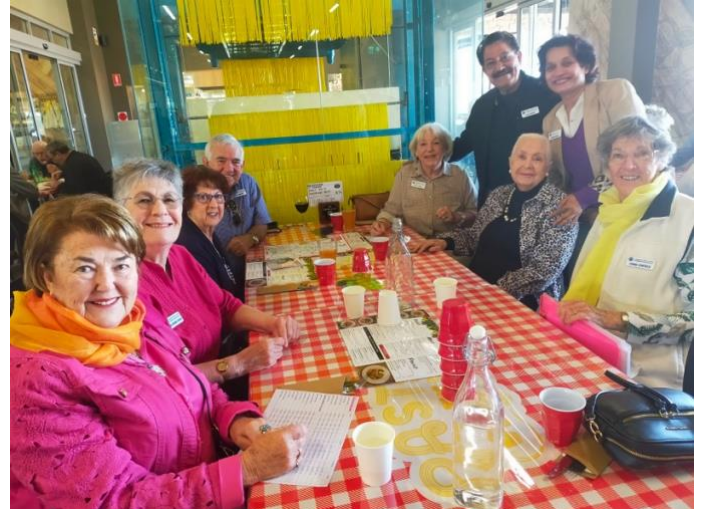
Combined Probus Club of Scarborough (Jo came later)