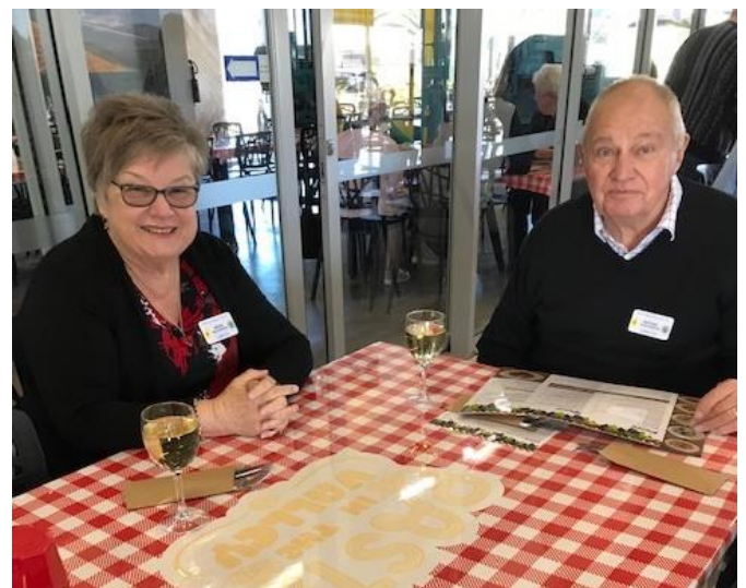
The Probus Club of Eaton