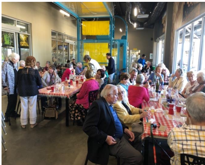
A general view of the venue and the Probus Club of Mundaring on the right.