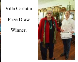
Villa Carlotta Prize Draw Winner.