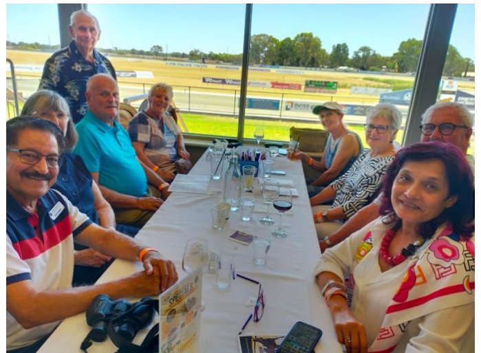
The Combined Probus Club of Scarborough Bch