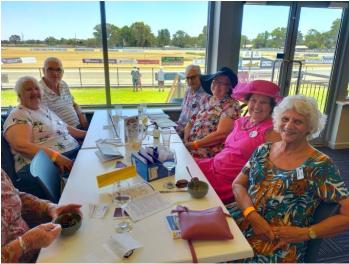
Canning Vale Probus Club