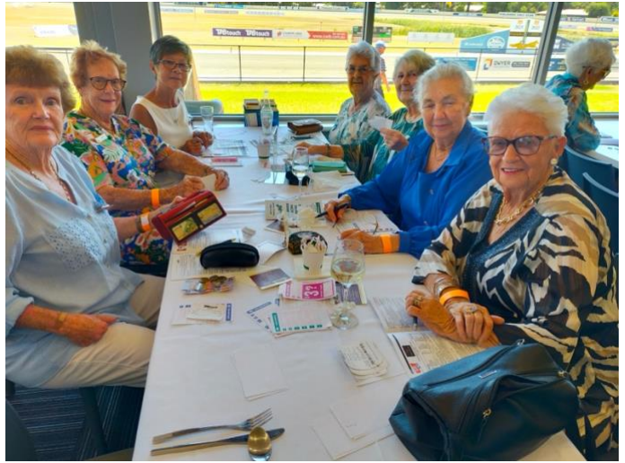
Mandurah Ladies Probus Club