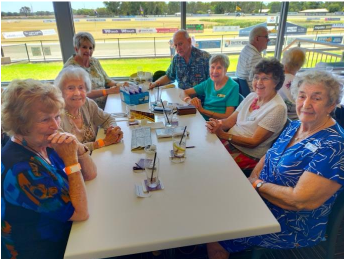
The Probus Club of Gosnells