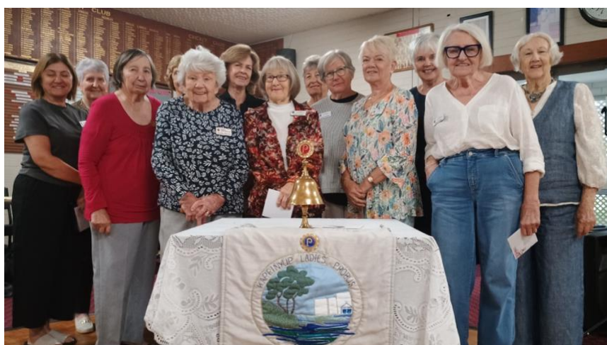
Left: Members who had birthdays in April and May.

It was a very busy meeting with our club accepting the new Constitution and our amended Standing Resolutions.